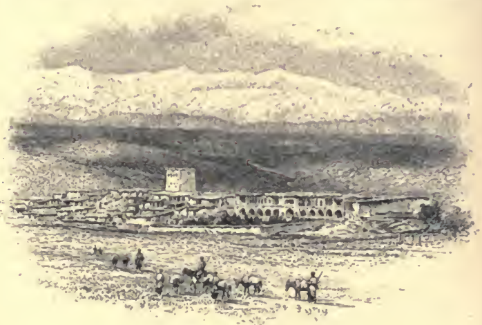
CASTLE OF ARDAL.

The palace or castle is like a two-storied caravanserai, enclosing a large untidy courtyard, round which are stables and cow-houses, and dens for soldiers and servants. In the outer front of the building are deep recessed arches, with rooms opening upon them, in which the Isfahan traders, who come here for a month, expose